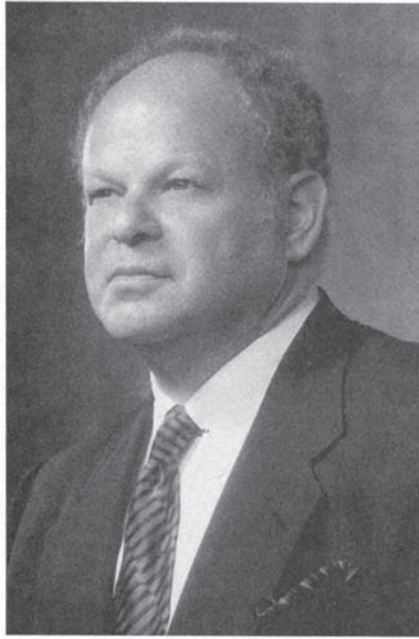
Martin E. P. Seligman